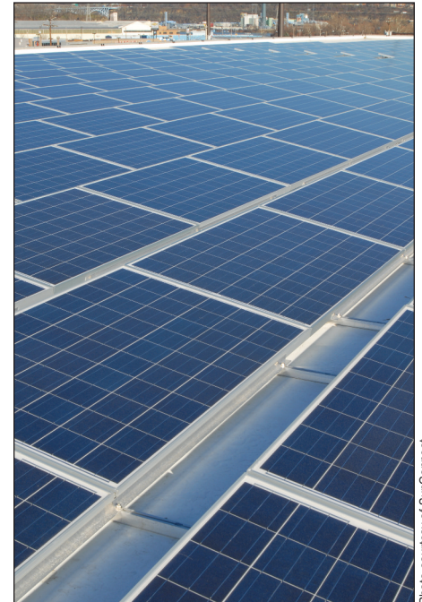
Commercial flat-roof top system