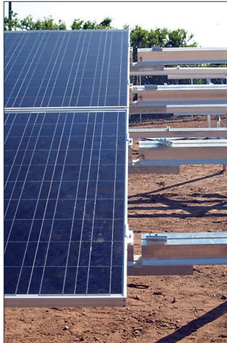
Small utility-scale ground mounted system

Three specific cost factors were considered: system components (rails, footings, clamps, etc.), fully burdened installation labor, and shipping costs. Cost of land and site preparation was not considered in ground-mounted scenarios.